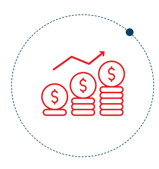
Streamline operating costs and reach more consumers.

Your contacts receive their card right away, without having to wait in line at the counter or for it to be mailed to them.