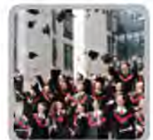
Education and training organization